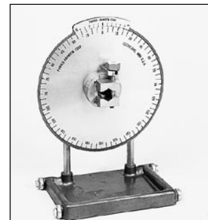
Fig. S39 — Universal Side Angle Indicator

Dimensions and pressures for reference only, subject to change.