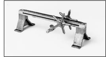
Fig. S36 — Mandrel Rod Stop Assembly /632

Part Name Mandrel Rod Stop Assembly (for bender Model HB632)..... Part No. 631141